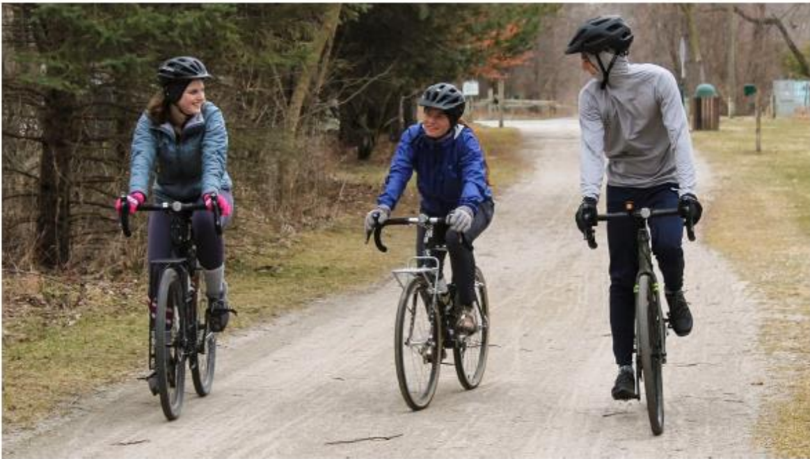
Riders training in Goshen, IN.